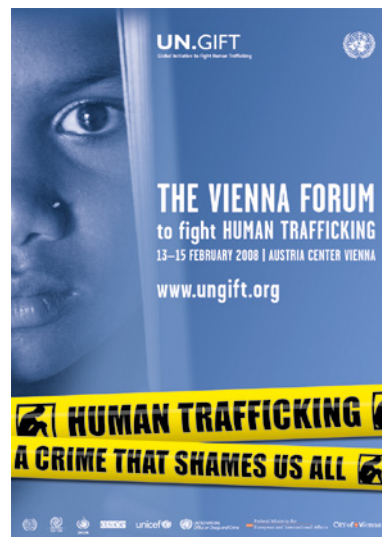
The branding / poster for the forum Idea and concept by Georg Suchanek