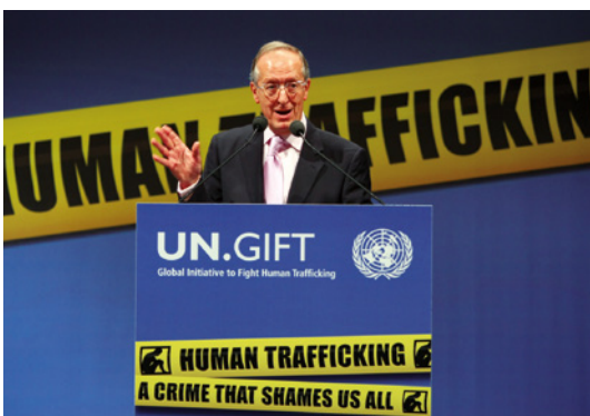
Mr. Antonio Maria Costa, Executive Director of UNODC