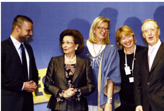
f.l.t.r.: Singer Ricky Martin; Suzanne Mubarak, former First Lady of Egypt; Ms. Ursula Plassnik, Austrian Federal Minister for International and European Affairs; Actress Emma Thompson; Mr. Antonio Maria Costa, Executive Director of UNODC

Furthermore consultancy for local partnerships (especially with the City of Vienna and the Foreign Ministry) and for the preparation process of the conference since April 2007.