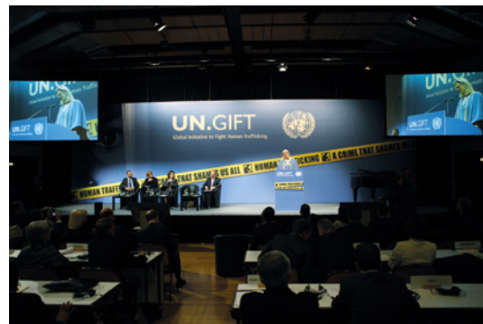
Plenary, Opening Ceremony